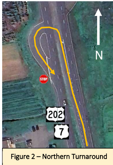
Figure 2 – Northern Turnaround

Automatic traffic recorder (ATR) data was collected on US Route 9W near the turnaround locations from Friday, September 6, 2025 through Thursday, September 18, 2025. The data indicates that on a typical weekday, US Route 9W currently serves approximately 6,280 vehicles per day (vpd) in the northbound direction and 6,245 vpd in the southbound direction. By comparison, US Route 9W serves approximately 5,400 vpd in the northbound direction and 5,370 vpd in the southbound direction on Saturday. In addition, an 85 th percentile speed of 65-mph was recorded in the northbound direction while an 85 th percentile speed of 62-mph was recorded in the southbound direction. Available gap data was also observed in both directions near the turnarounds. The raw traffic data is included under Attachment B.