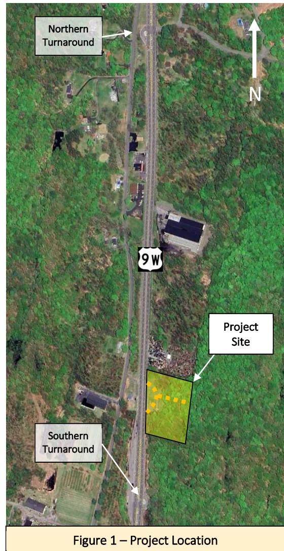
Figure 1 – Project Location

A review of the existing curb cuts on US Route 9W indicates that only right-turns in and out are permitted due to the median and guiderail; however, a review of US Route 9W indicates that there are “turnarounds” located approximately 2,850-feet north and 750-feet south of the site as shown on Figure 2 and Figure 3. Vehicles traveling south on US Route 9W that want to turn left into the site would pass the facility and use the